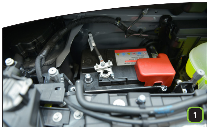
Open up the hood and disconnect the battery! DO NOT PROCEED with the battery connected!