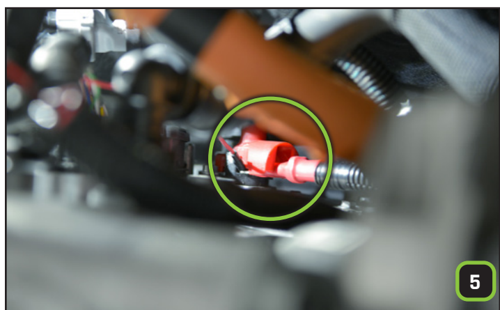
Locate and remove the highlighted plastic cover. It is situated near the EM connector.