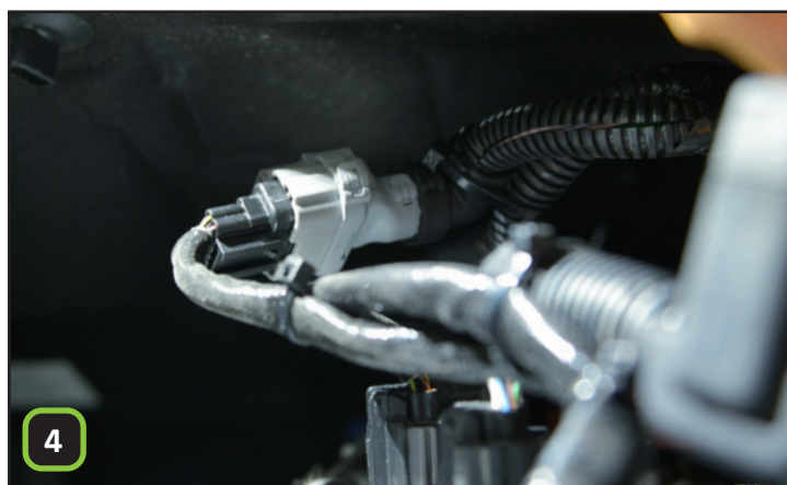
Connect the STEINBAUER harness between the connector and the original wiring.