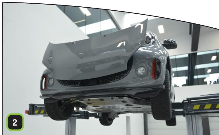
Lift up the vehicle.